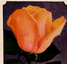
★ Duchess of Wellington. 75c